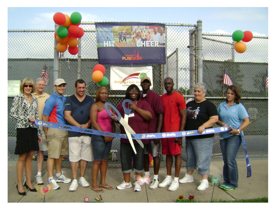
A ribbon cutting was held for Kelley Tennis Club on September 8th.

A ribbon cutting was held on September 5th at Cypress Gardens Apartments. They are located at 11511 Highway 90, 77013.