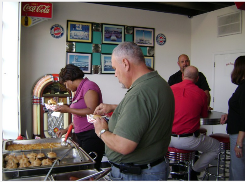
Chamber members had a great time at the Business After Hours hosted by Bates Collision Centers.